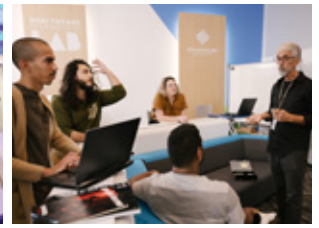
Full Sail University Healthcare Technology Lab powered by AdventHealth University