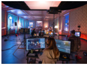
Studio V1: Virtual Production