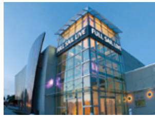
Full Sail Live Venue