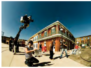
Full Sail Backlot