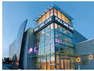
Full Sail Live Venue